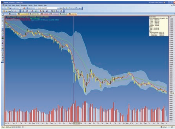
CHART TYPES (18 types)

Line, Bar, Candlesticks, Candlevolume, Counter Clockwise, Dotted, Equivolume, Filled Area, Histogram, Kagi, Linked Forest, Point and Figure, Renko, Scatter, Stepped Line, Three Line Break, Yield Curves, Market Profile