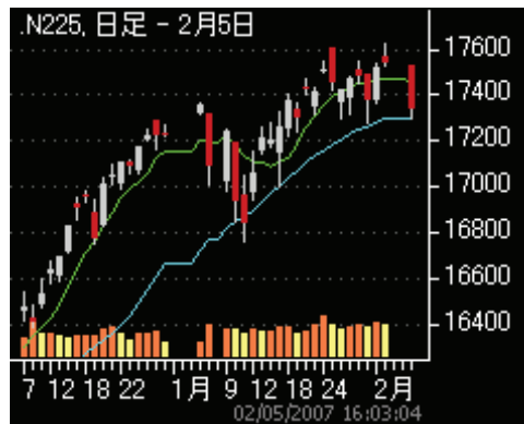
daily chart with volume and DSMA - Nikkei 225 index