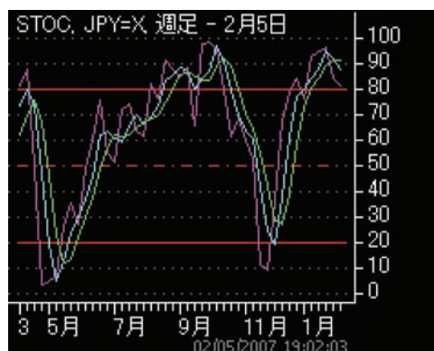
Stochastics for USD/JPY rate