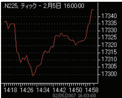
simple tick chart - Nikkei 225 index

JigsawMobile high-performance chart server produces charts from tick data and historical data, and can be configured to produce charts for various time intervals (depending on the data source) – for example tick charts, daily, weekly and monthly charts, as well as intra-day charts with pre-defined intervals, such as 3 minutes or 5 minutes. Charts can be displayed using candlestick, bar or line styles, with volume data (if appropriate).